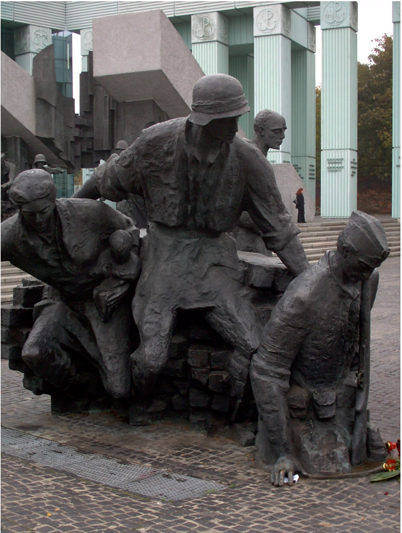
Photo I took in Krasinski Square on Saturday 9 th October 2004 of the 1944 Warsaw Rising monument depicting insurgents entering the Sewers.

Earlier during WWII, there was a significant presence of eastern Poles in Iran. In August 1939, just days preceding Hitler's invasion of Poland on September 1 st 1939, Hitler's foreign minister Joachim von Ribbentrop in Moscow signed what became known as the Molotov-Ribbentrop pact or