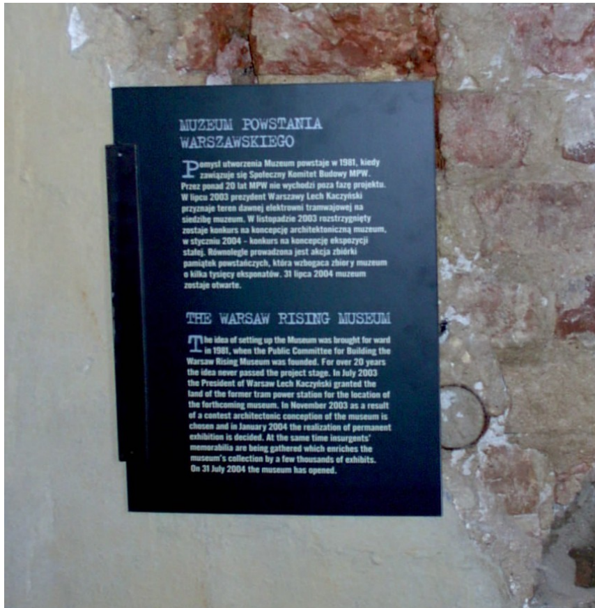
Photo taken by me on Saturday 09 th October 2004 at the Warsaw Rising Museum of the tablet documenting its founding on 31 st July 2004, just over two months before my visit.