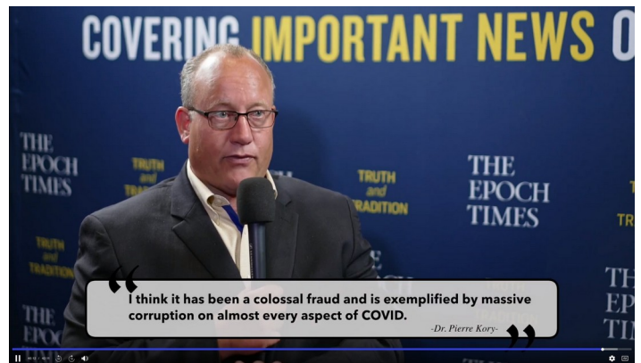
The Epoch Times interview of Dr. Pierre Kory https://www.theepochtimes.com/the-vaccine-injured-are-being-ignored-dr-pierre-kory-on-vaccine-injury-syndrome-and-the-suppression-of-early-covid-treatment_4622746.html dated July 26 th 2022.