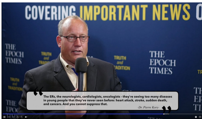
The Epoch Times interview of Dr. Pierre Kory https://www.theepochtimes.com/the-vaccine-injured-are-being-ignored-dr-pierre-kory-on-vaccine-injury-syndrome-and-the-suppression-of-early-covid-treatment_4622746.html dated July 26 th 2022.