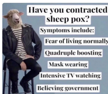
Dr. Robert Malone's dry sense of humour is again most poignant.