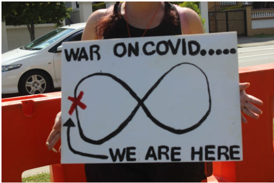
Photo taken by me at the Musgrave Park Freedom Rally South Brisbane Saturday 18th December 2021.

https://vincebarwinski.com/2022/01/08/letter-to-annastacia-palaszczuk-premier-of-the-state-of-queensland-commonwealth-of-australia-monday-3rd-january-2022/